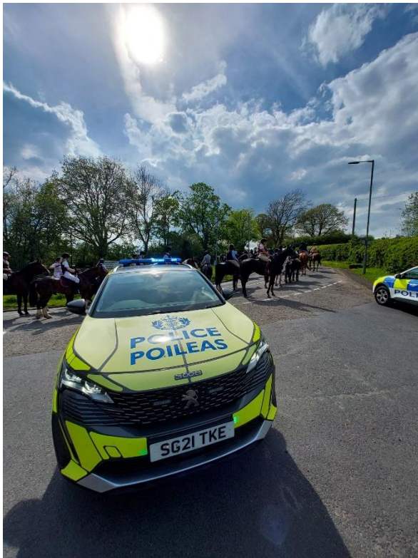
Officers on duty at Bonchester Bridge ride out, 11 th May 2024

Obviously May saw the bulk of the ride outs for Hawick Common Riding in the lead up to the ceremonial events. Local officers were heavily involved in both extensive planning for these events and policing them on the day. Hawick Common riding marshals and community officers worked closely together to ensure that these events went safely with as little disruption as possible. Hawick Common Riding Marshals did an excellent job, without their time and dedication these events could not go ahead.